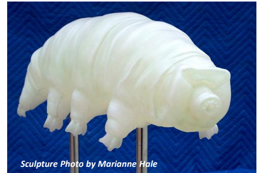
Sculpture

Range: Found throughout the world, from the Himalayas to the deep sea, and from the polar regions to the equator.